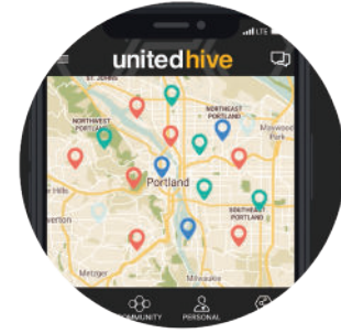
Evangelism AP UNITED HIVE