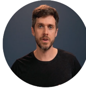
How to Witness Videos TAKE THE CITY